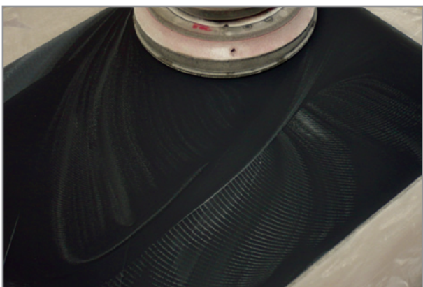
Damp finish with 3M P3000 Finishing Disc

6. Repeat step 5 with progressively finer abrasives including P1500 – try not to over-sand damaged area. Feather edges beyond previous step.