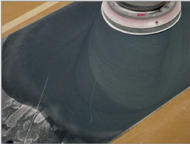
Dry sanding with 3M 260L

4. Depending on the depth of scratch, select abrasive disc and attach to interface pad.